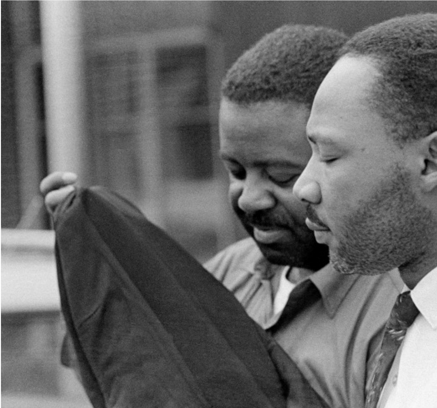
Martin Luther King and Ralph Abernathy (background) leave Birmingham City Jail following their release on April 20, 1963, after eight days of imprisonment.

King's famous "Letter from Birmingham Jail," published in The Atlantic as "The Negro Is Your Brother," was written in response to a public statement of concern and caution issued by eight white religious leaders of the South. It stands as one of the classic documents of the civil-rights movement.